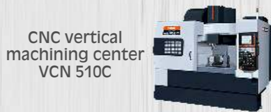
CNC vertical machining center VCN 510C