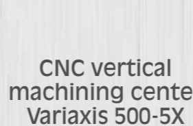
CNC vertical machining center Variaxis 500-5X