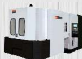
CNC horizontal machining center FH-7800