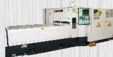
CNC laser cutting machine SUPER TURBO X MARK II