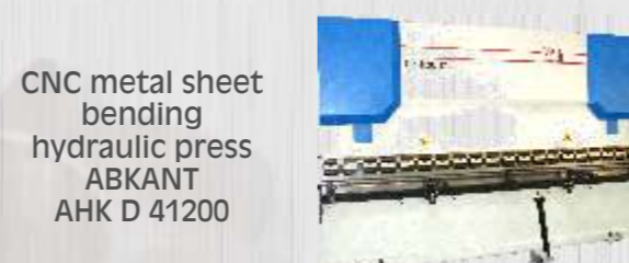
CNC metal sheet bending hydraulic press ABKANT AHK D 41200