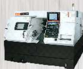
CNC lathe QTN 200II-1000U, QTN250II-1000U, QTN 350II-1200U